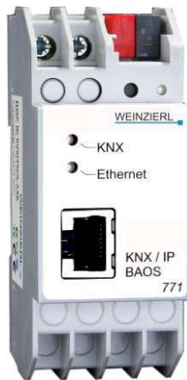
Figure 1: Photo of device

The KNX IP BAOS 771 is used as interface to connect to KNX both on telegram level (KNXnet/IP Tunneling) and on data-point level (KNX Application Layer) with up to 250 comm.-objects. BAOS stands for "Bus Access and Object Server". The connection is made through LAN (IP).