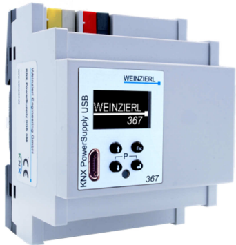
Photo of the device

640 mA Power supply with integrated USB interface, KNX node, and diagnosis functions